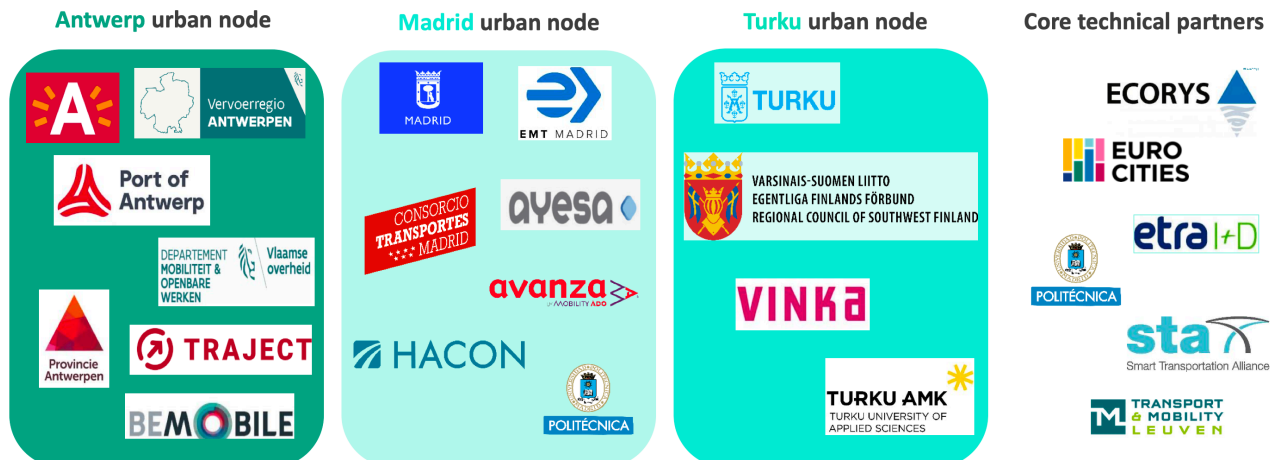
Figure 2: The SCALE-UP consortium partners

User-Centric & Data Driven Solutions for Connected Urban Poles